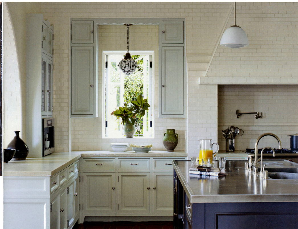
OPPOSITE, FROM TOP: In the kitchen, cabinetry by architect Kevin A. Clark complements tiled walls; the pendant light in the window is from Blackman Cruz. Balconies of wrought iron and turned wood overlook a star-shaped fountain.