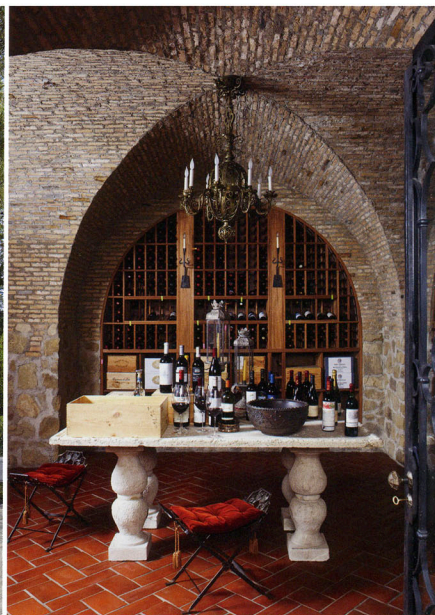
FROM LEFT: Rosenfeld in his 1961 Mercedes-Benz 300SL Roadster. A stone serving table stands beneath a vaulted brick ceiling in the wine room; the stools are 1920s Italian, and the 19th-century French bronze chandelier is from Connoisseur Antiques.